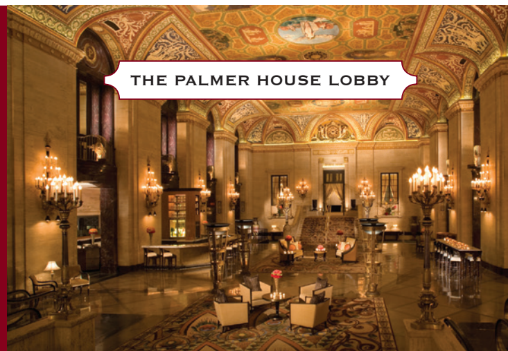
THE PALMER HOUSE LOBBY

Reservations requested after the group cut-off date are subject to availability. Cut-off Date: August 10, 2012